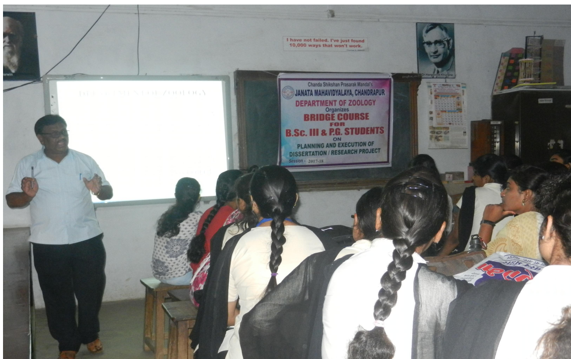
Presentation on Bridge Course Programme conducted on: - Planning and Execution of Dissertation / Research Project on dated: 9.1.2017 – 16.1.2017