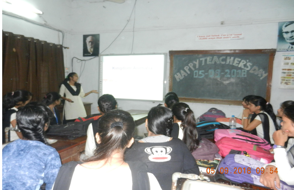
Student Seminar conducted on 5 th September 2018