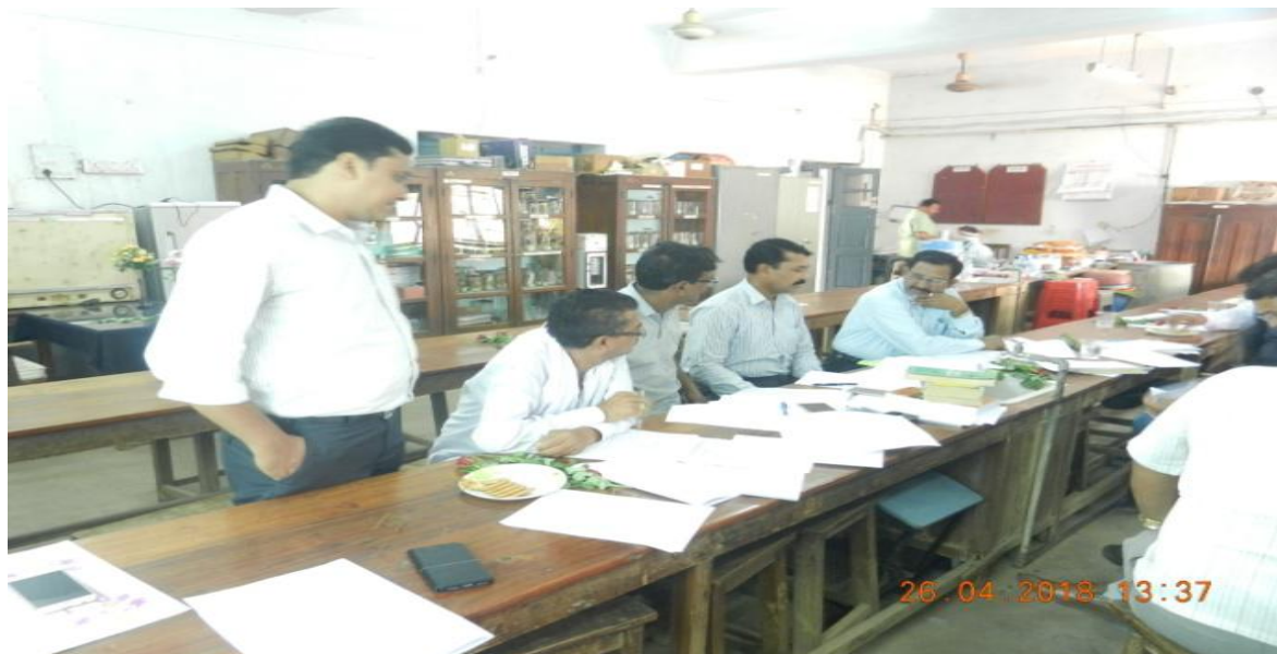
BOS meeting on discussion and restructuring of B.Sc. II and III year Syllabus Venue: Department of Zoology, Janata Mahavidyalaya, Chandrapur.