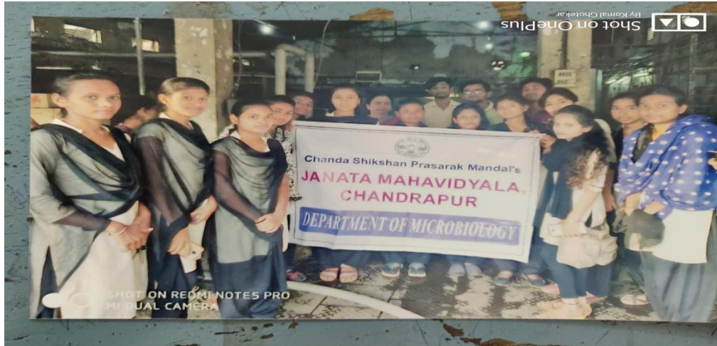
Visit to Maharashtra Dairy Unit, Chandrapur: Session-2017-18