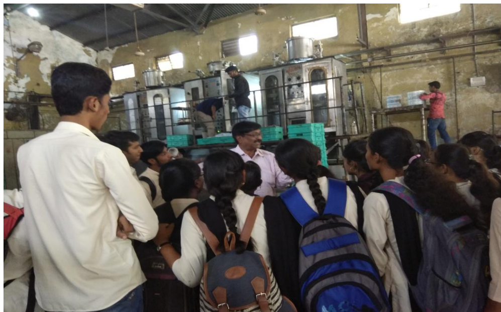
Visit to Water Treatment Plant, Tukum , Chandrapur: Session 2017-18